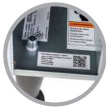
Unit specific QR code for quick access to service manuals, cleaning guides and warranty history