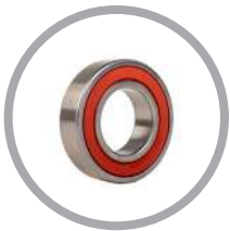
Sealed, maintenance-free bearings ensure maximum reliability and contribute to a long machine life

UF1415 - 140 lb Self-Contained Ice Machine