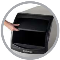
Ergonomic slide back door allows easy access to ice in the bin