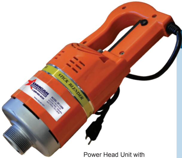
Power Head Unit with Variable Speed Control