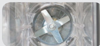
Stainless Steel Blade

ON/OFF SWITCH VARIABLE SPEED DIAL HIGH/LOW PULSE